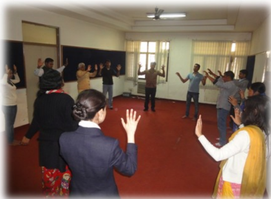
The participants trying to feel themselves physically, mentally, and spiritually

The DB ARK team members had developed a new Program for the children who had been victims of abuse, violence, and other traumatic experiences. The VOC – VOICE OF CHILDREN – is a PSYCHO-SPIRITUAL TOOL being used by DB ARK to lead the children from 'Brokenness to Wholeness'. The team felt the need to look into themselves and get healed in every aspect so that they be better prepared to accompany the children who had been 'broken' due to many experiences that they have gone through.