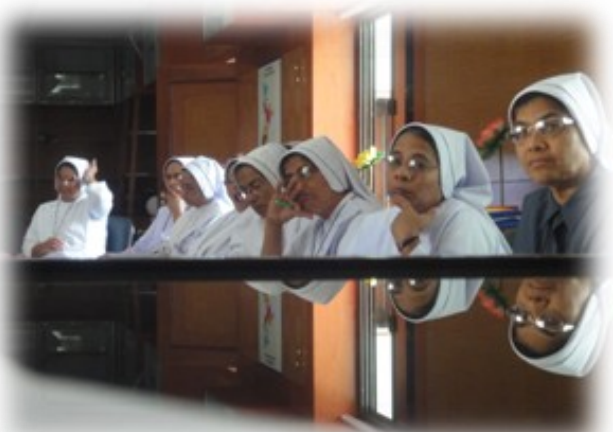
Attentive, involved and eager to know “How to grow old Gracefully!”

Based on their core meaning, and the core competencies they were made aware of the dramatic events they have encountered in their lives. They were able to recapture the sparks produced then in these encounters, and relive the passionate responses. Such an exercise inspired and enthused the participants to plan out the new phase in their lives as they move towards their sixties.