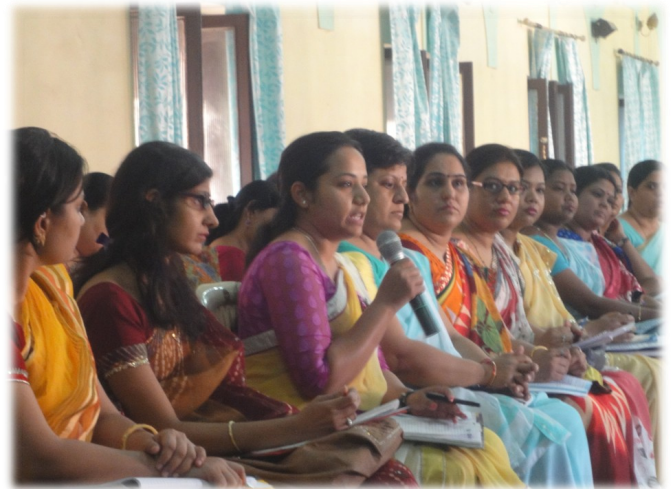
Teachers participate enthusiastically putting across their views on St. Patrick's Vidhya Bhavan School

One must know his / her Personal Vision, so that one's Personal Vision gets aligned with the Organization's Vision ... This ensues commitment from all.