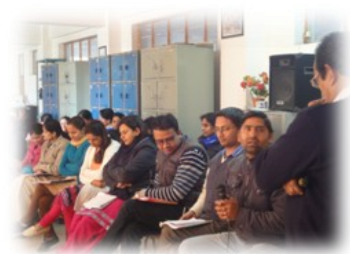
Queries of the teachers being answered

The 45 Teachers of Mount Carmel School, Gaggal who attended this program were eager to understand the new mind-set required to accompany the students towards their emotional and spiritual growth. They were unanimous in requesting a follow-up Seminar cum Workshop to practice the New Pedagogy proposed to them. They wanted to acquire the new skill-set to be proficient in the practice of this new Pedagogy.