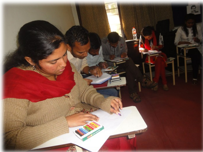
The participants portraying their most significant past experiences by using left hand

The DB ARK Team went for an 'INNER HEALING Retreat' to enjoy the peace and joy of being healed spiritually. The 'God Dimension' is a powerful component in the VOC program. However, it was felt that an Integration of Mastery and Mystery would make the team members powerful agents of the healing process.