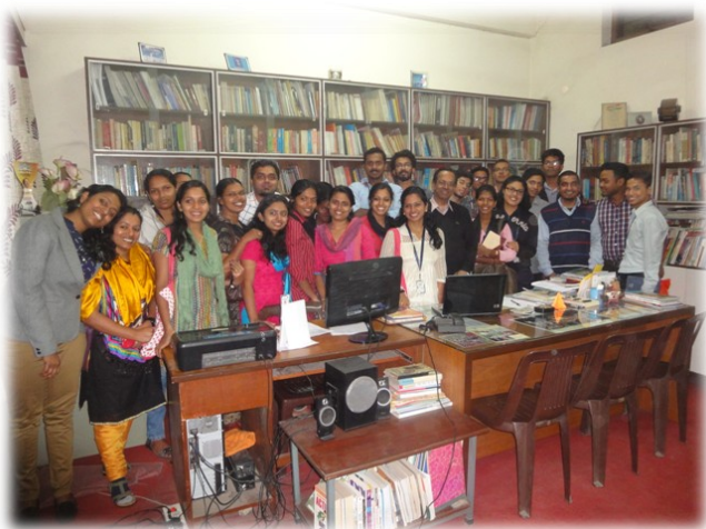
Loyola College Students feeling ecstatic with the crew of DB ARK

The team leaders of DB ARK introduced their respective departments with particular vision and mission of each department and their functioning.