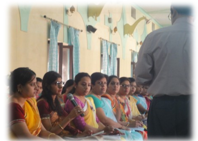
Sharing of the vision on an individual basis

What the participants appreciated most was 'the versatility of the resource person, the variety of methods used in the seminar, and the great humor that kept the group alive and exuberant throughout the seminar.'