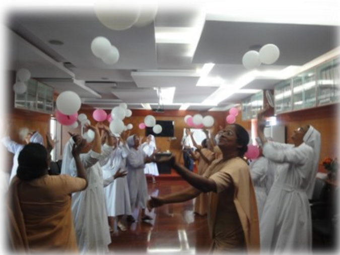
Discovering their competencies through a joyful activity

The participants were unanimous in resolving to become a 'Blessing' to their communities rather than a liability or a burden.