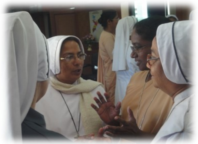
Drawing conclusions in groups at the end of the session.

The 22 Sisters of Charity belonging to the age group of 55 to 60 spent three days at their Provinciate at Punjabi Bagh, New Delhi to plan ahead to run faster as they reach their 'Diamond Jubilee'.